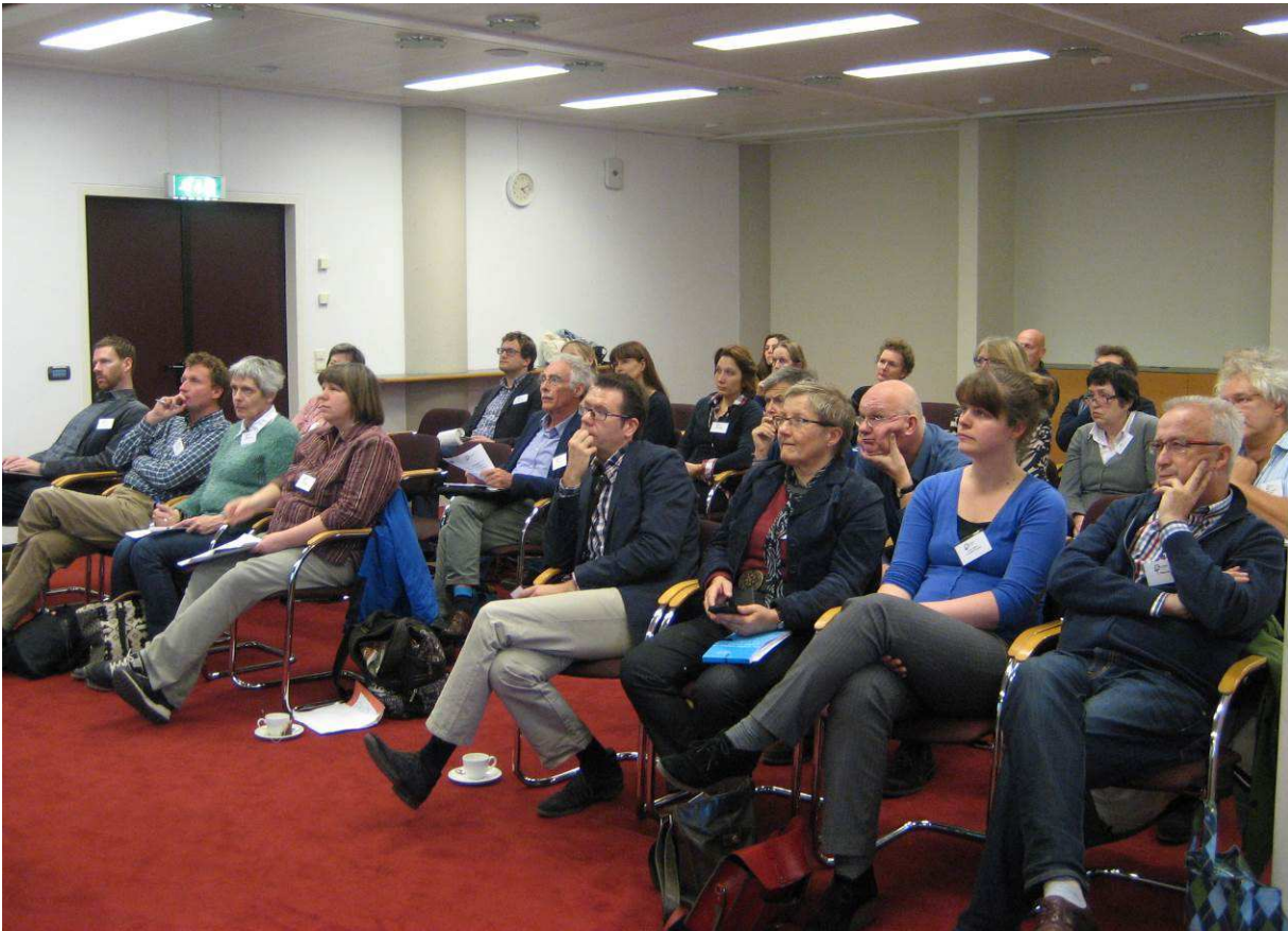
The participants of the Information Day